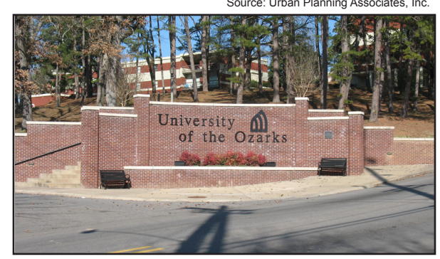
Gateway to the University of the Ozarks

In 1891, the school was moved to Clarksville and renamed Arkansas Cumberland College. In 1920, the school became College of the Ozarks and later, the University of the Ozarks. This college was the first in Arkansas to graduate a woman (1872) and the first historically white college in the state to admit an African-American student (1957).