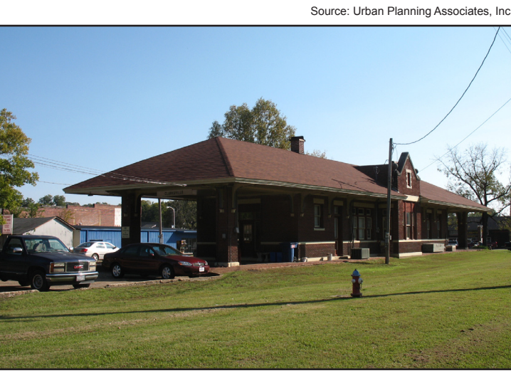
Historic Train Depot and Chamber of Commerce Office